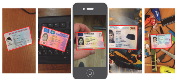
Fig. 1. Example frames from MIDV-500 dataset. 5 different conditions are presented (left to right): Table, Keyboard, Hand, Partial and Clutter

Thus, 500 videos were produced: (50 \text{ documents}) \times (5 \text{ conditions}) \times (2 \text{ devices}) . Each video were at least 3 seconds in duration and the first 3 seconds of each video were split with 10 frames per second. In total there are 15000 annotated frame images in the dataset. Each captured frame had the same resolution of 1080 \times 1920 px. Original images of each document type are also provided within the dataset for reference.