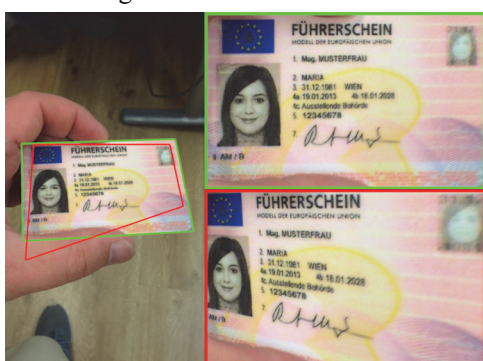
Fig. 4. Projectively restored document images for the ground truth quadrangle (green, \sigma=0 px) and after applying coordinate noise (red, \sigma=50 px)

With the described noise applied to the document boundaries, projective restoration of document images was performed as before, for a range of \sigma values (see example in Fig. 4). Then, the face detection algorithms were re-evaluated using the metric described above.