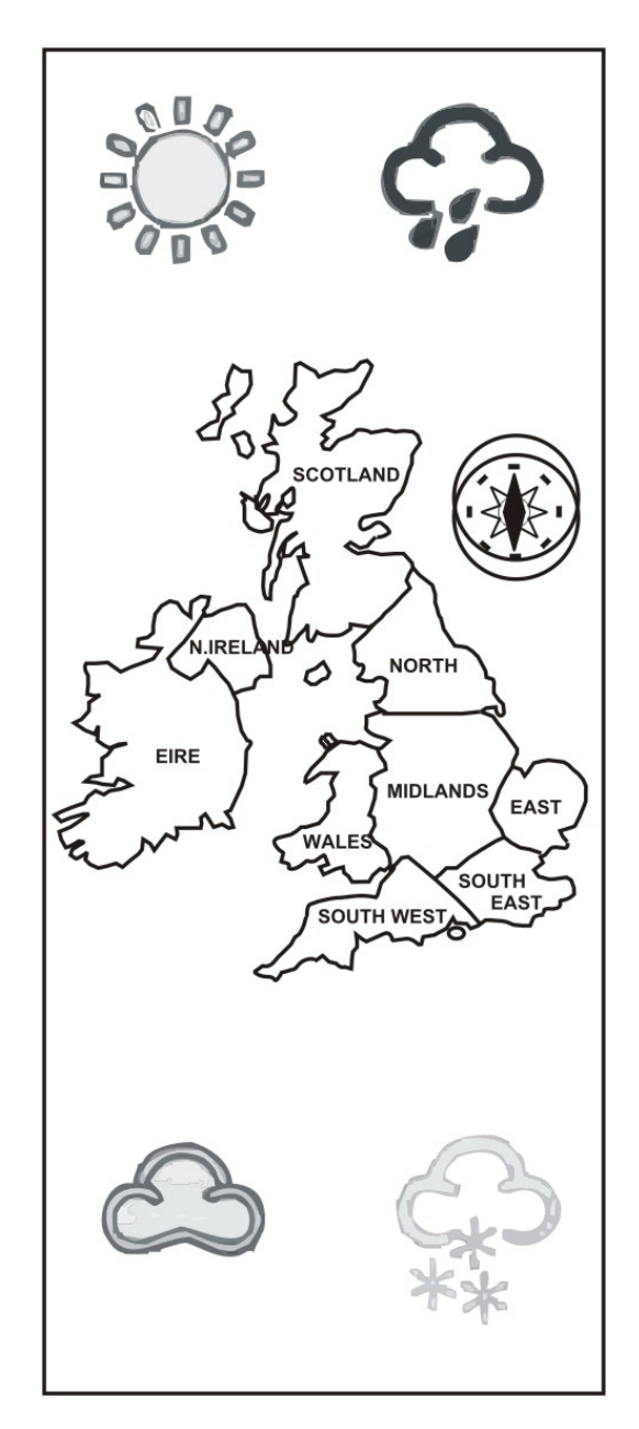
Task 9. Listen to the weather forecast for the British Isles and put the symbols in the correct place on the map. What is today's weather forecast where you are?