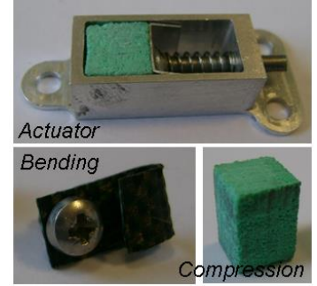
Fig. 1 The samples of the Ribes_Foam2 experiment.

The strategies for the development of the samples were discussed in [9]. In Figure 1, the image of the samples is shown.