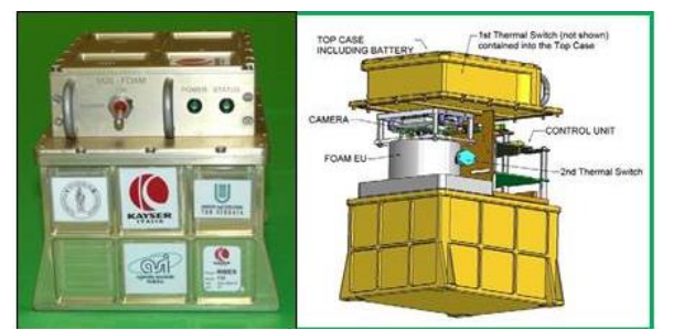
Fig. 2 The apparatus of the experiment Ribes_Foam2.

Temperature data loggers, optical sensors (for the compression configuration) and the camera (for the other two configurations) were used to measure the foam recovery as a function of time and temperature. The heating plate was opportunely thermally insulated by means of plastic spacers and a base plate. The unit external walls were made of thermally insulated foam, except for the top external surface which was made of polycarbonate to permit the image acquisition. Figure 2 shows the apparatus and Figure 3 shows the view of the samples integration before flight. More details of the equipment can be found in [11].