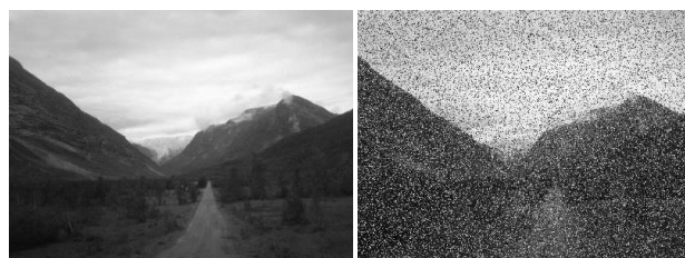
a) Original image.