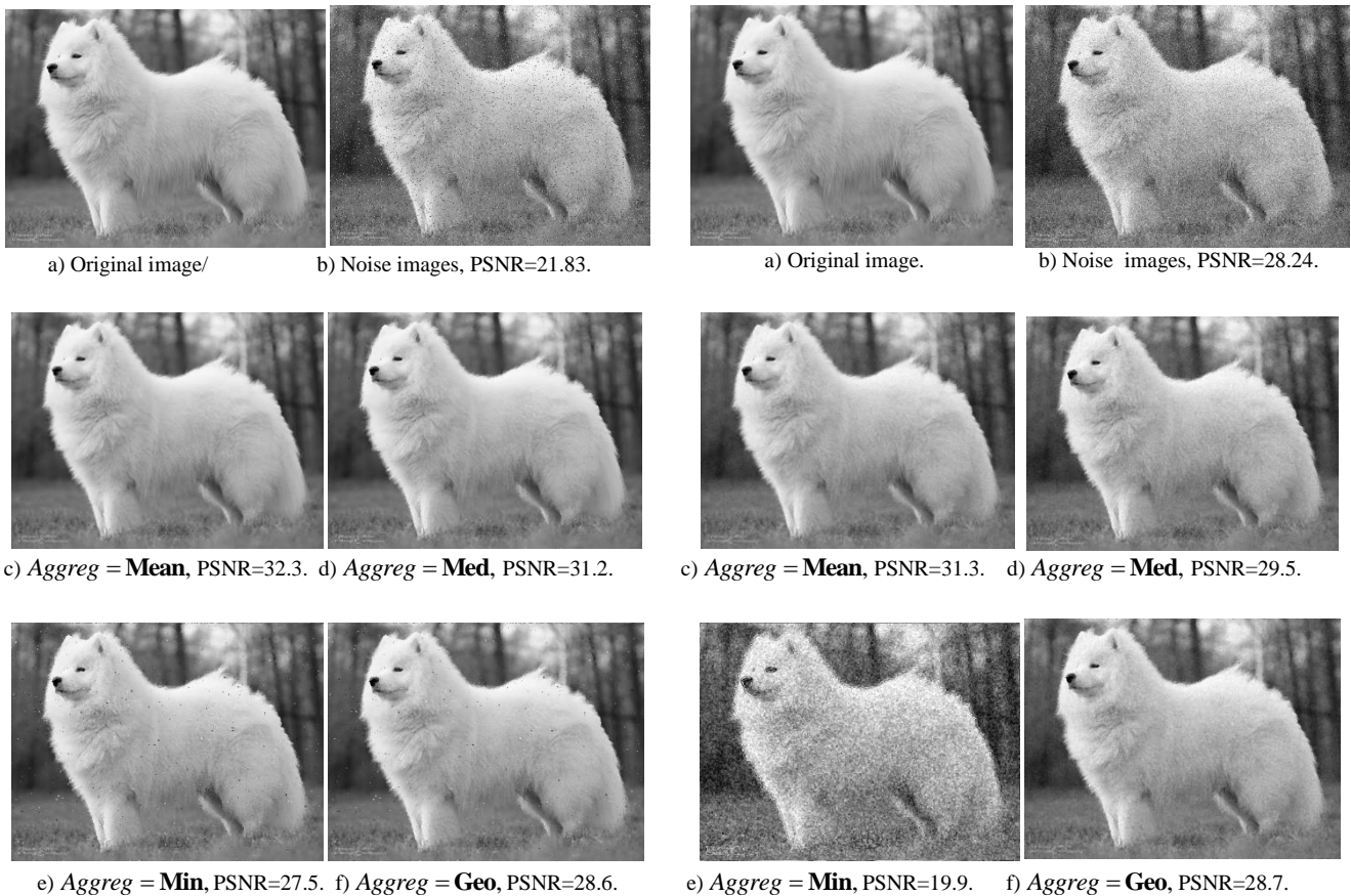
Fig. 2. Original (a) and noise (b) images. Noise: "Salt-Pepper PD". Denoised images (c)-(f).

As we see, aggregation operator Arith is used in (39)-(42). We can use here an arbitrary aggregation operator Aggreg . Some of similar filters can find in [7-10].