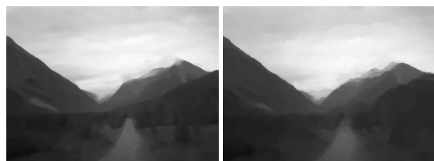
e) ElMean , PSNR =28.