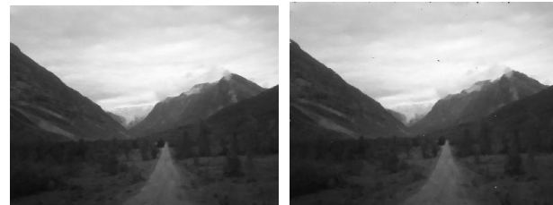
c) MonMean , PSNR =30.