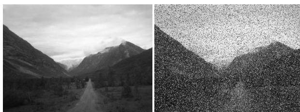
a) Original image.