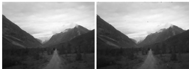
c) MonMean , PSNR =29.