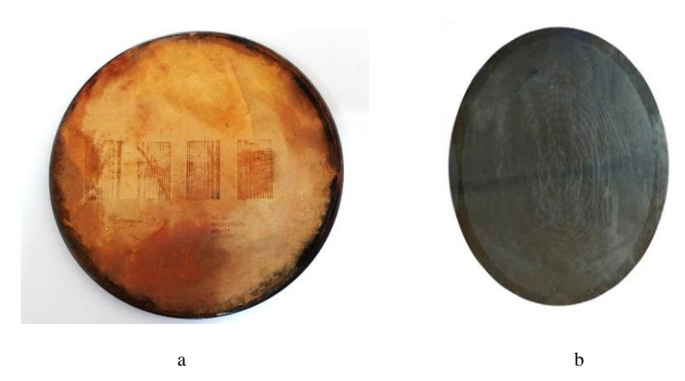
Fig. 1. The test objects: binary lens (a) and focusator to a point (b).

stepped profile is created closely to the calculated one (overetching is less than 100 nm), and the gradient profile is characterized by a significant (greater than 1 µm) underetching in the central area and even more at the periphery.